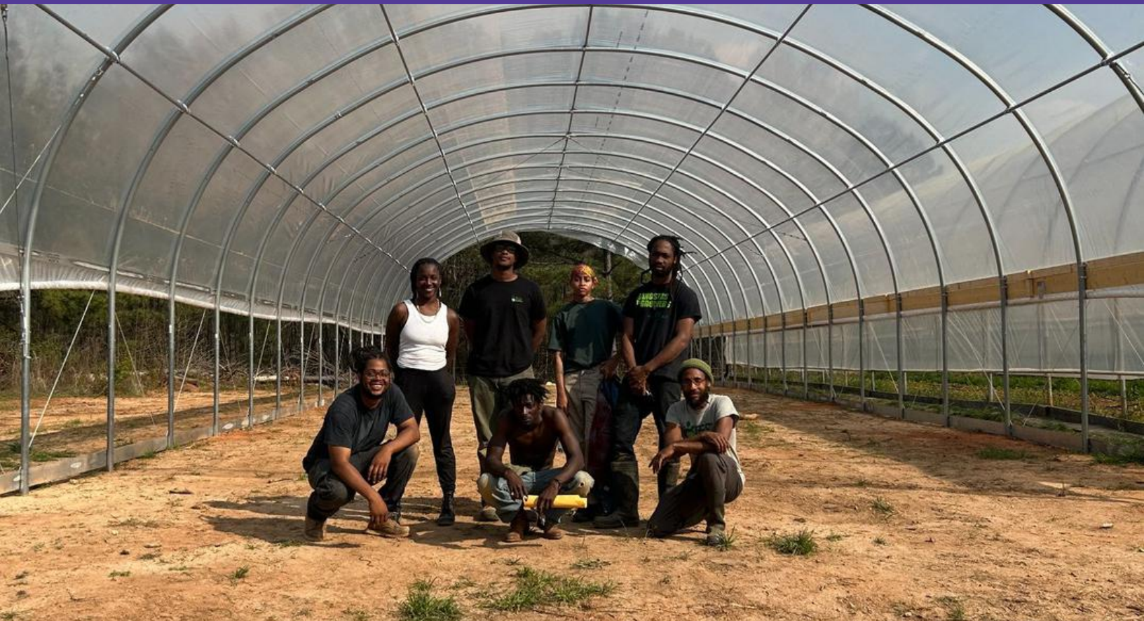
Photo description: EP Crew builds 30x96 High Tunnel at Love is Love Cooperative Farm, Mansfield, GA.