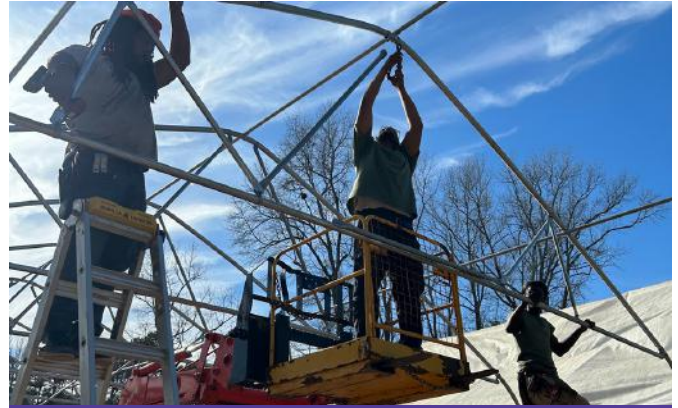
Photo description: EP Crew building Greenhouse.

To learn more about ECO-PARADIGM, please visit www.ecoparadigm.net .