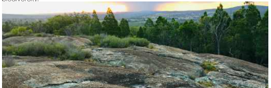
Banner : Flannel Flower

Everywhere around us all, nature in all its incredible diversity and resilience can be observed. I walk for many kilometres over a fascinating wild landscape of thousands of hectares in the immediate environs and in the nearby Amiens State Forest. There are so many things happening to trees and in and under them as well. This forest is certainly alive. Life on a Nature Refuge never stands still. Well, not unless you are a granite monolith.