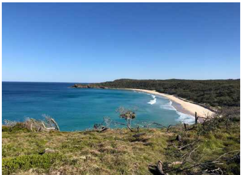
Banner & Above: Noosa National park

I look back on my parents' decision to move from the big city to little Sunshine Beach, and I just feel lucky. Growing up I don't think I knew just how lucky I was, but I do now and this is why it's so important to me that future generations have the chance to experience what I have.