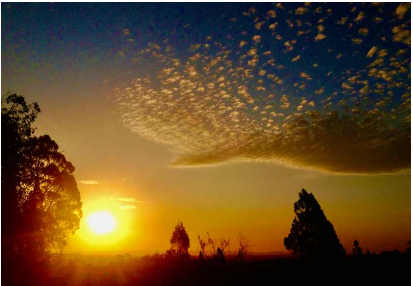
Above: Tumbledown National Park.

We send our heartfelt condolences to her friends and family.