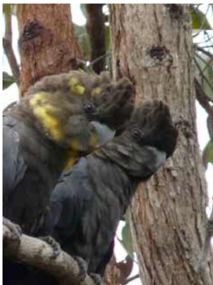
Banner: Glossy Black cockatoo feeding, Inline (right): Glossy pair Above: Glossy cockatoo pair.

The Glossy Black-cockatoo ( Calyptorhynchus lathami ) is the smallest of Australia's five endemic black cockatoos. The adults grow up to about 50cm in length and have, in contrast to their English name, dusky chocolate heads and ashey-black plumage. Like many birds, the adults are sexually dimorphic meaning that males and females look different to one another. Males typically have a clear dark plumage apart from the tail which is barred with bright scarlet-red, while females have a splattering of yellow across their head and throat and their tail barring is more sunset-orange.