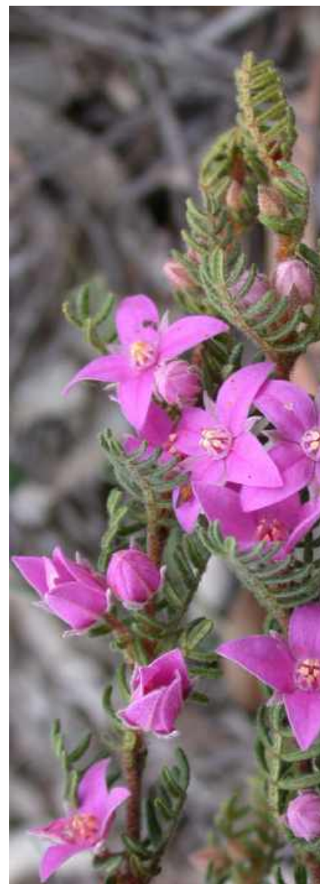
Banner