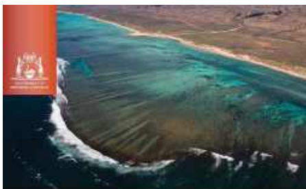
PLAN FOR OUR PARKS SECURING 5 MILLION HECTARES OVER 5 YEARS

As a summary – the WA government is committed to substantially expand the protected area estate by around 5 million hectares over the next five years – an increase of 20%. New parks are located along the coastline as well as inland areas, and cover the latitudinal range of the state – from The Kimberley to south of Perth. They will protect significant (but currently under-protected) habitat of wetlands, marine areas including fringing reefs and inter-