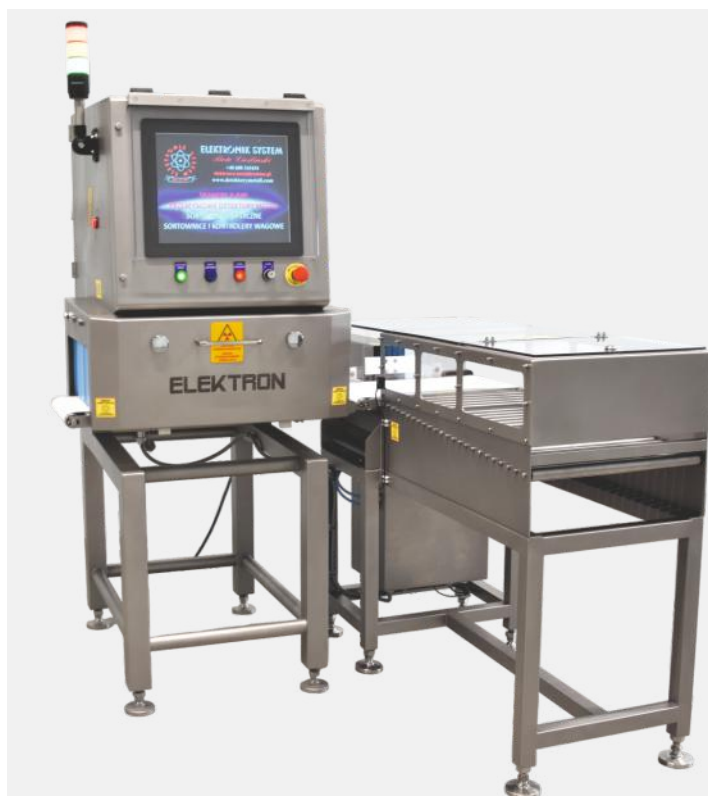
Pusher with roller pallet