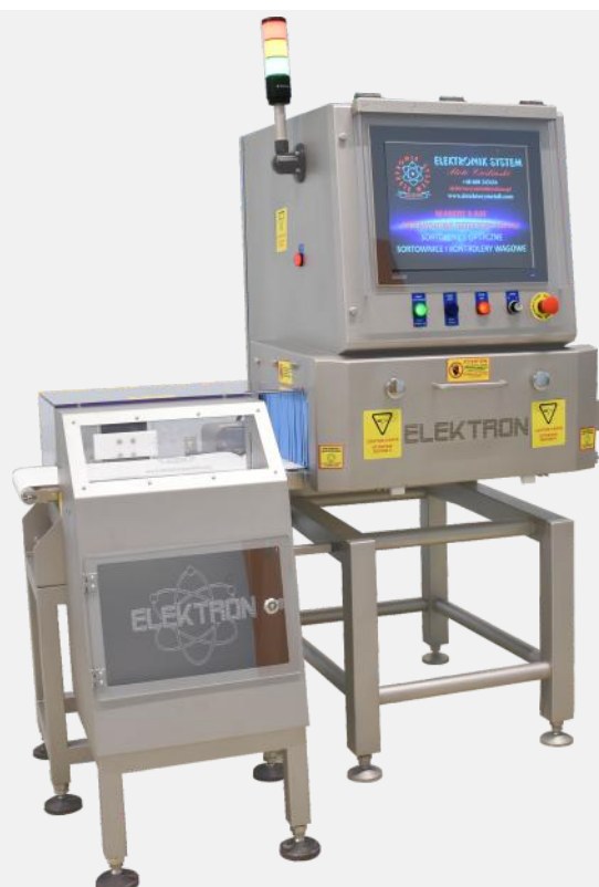
Pusher with a lockable container