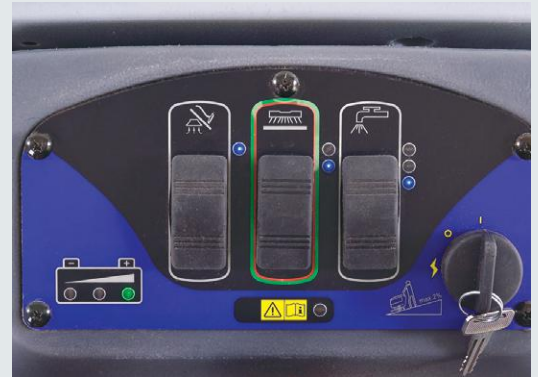
The ST 26 inch disc model – provides simple operation and robust scrubbing controls.