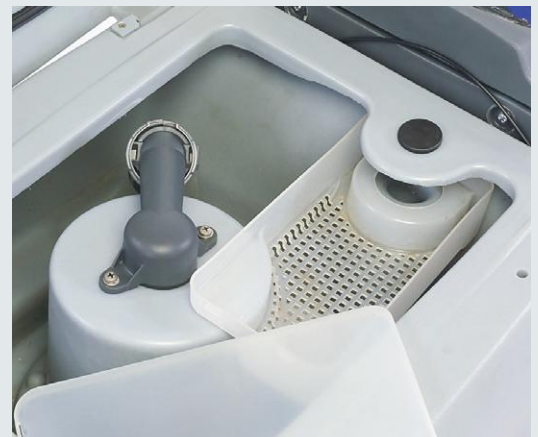
An integrated debris catch cage traps and collects drain clogging debris.

For use on extreme soil levels (10% of scrubbing applications)