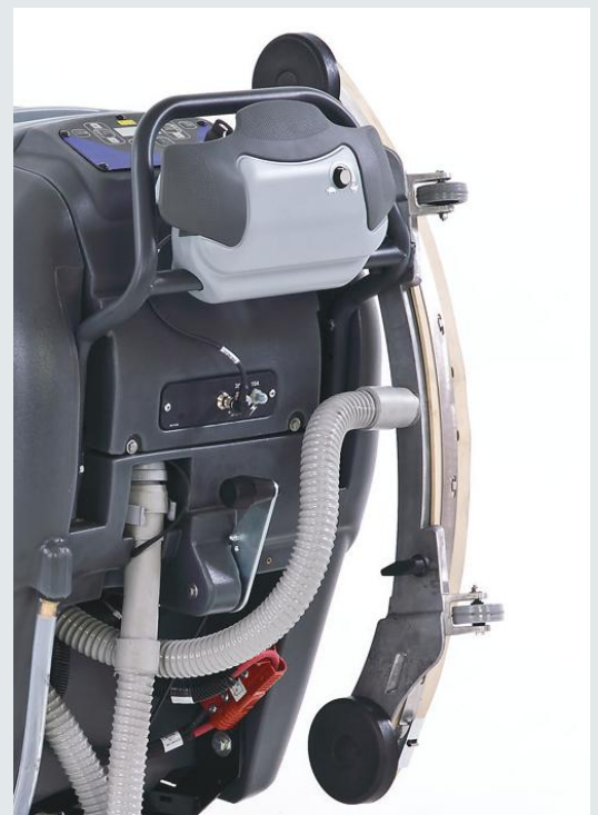
A built-in squeegee hanger makes transport easier and reduces trip and fall accidents.

One-Touch™, integrated scrub pressure and solution flow rate settings: