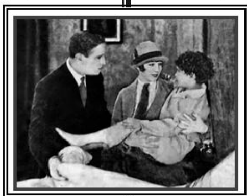
Conway Tearle, Margaret Morris and Frankie Darro.