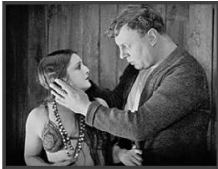
Emil Jannings and Lya De Putti