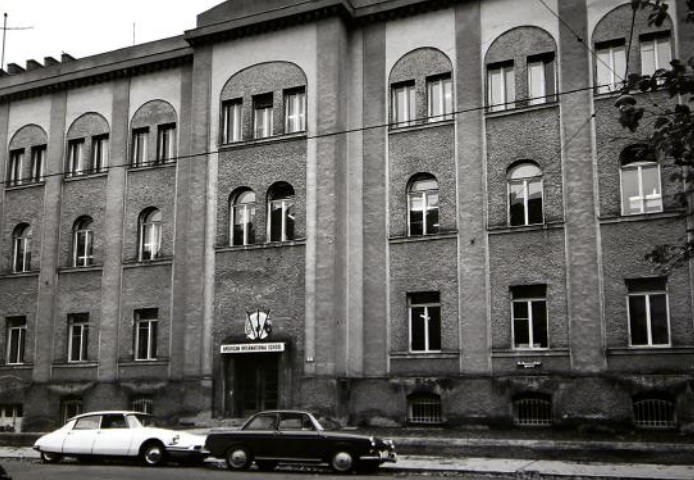
Former AISV building on Bauernfeldgasse 40