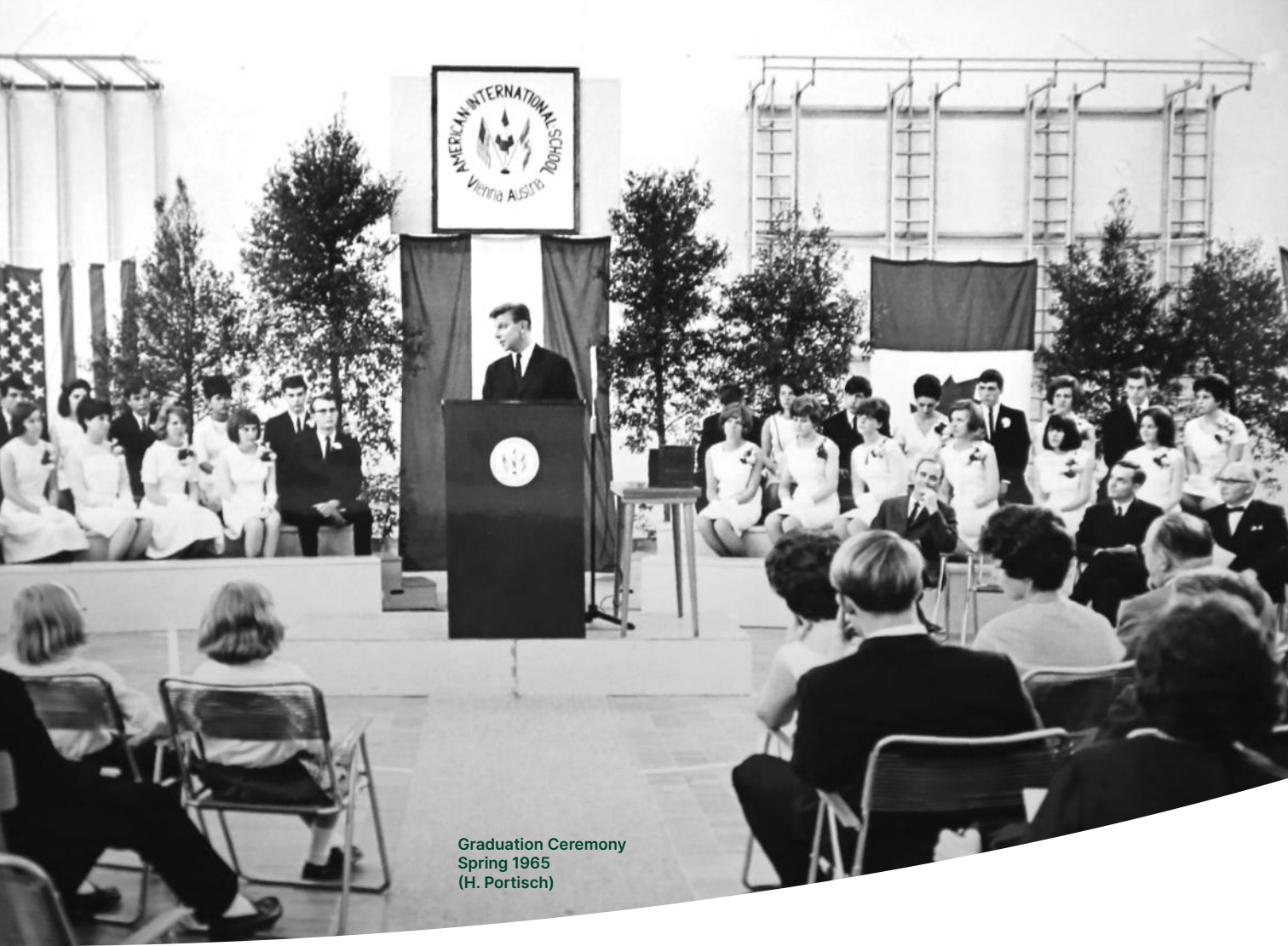
Graduation Ceremony Spring 1965 (H. Portisch)