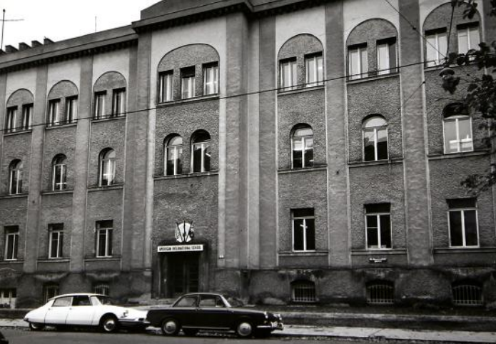
Former AISV building on Bauernfeldgasse 40