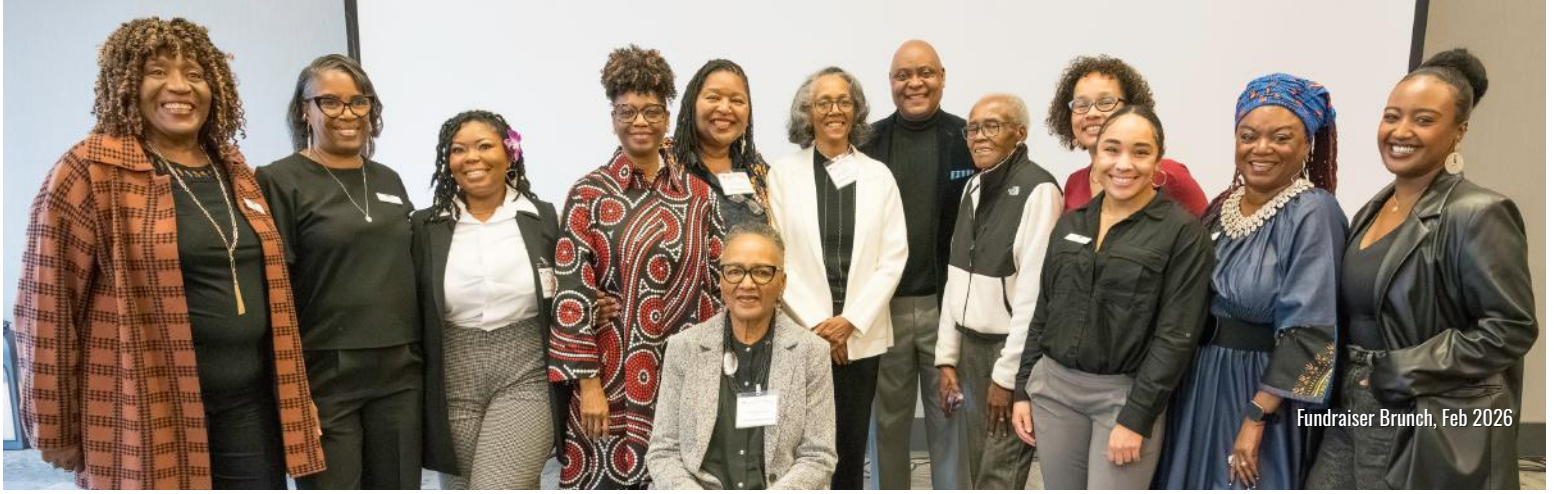
Fundraiser Brunch, Feb 2026