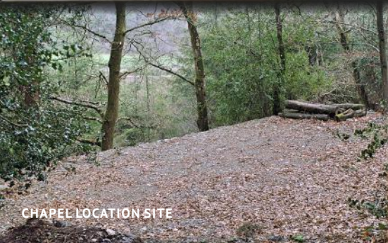
CHAPEL LOCATION SITE