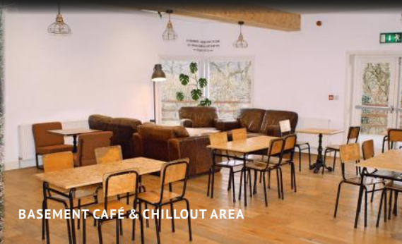
BASEMENT CAFÉ & CHILLOUT AREA